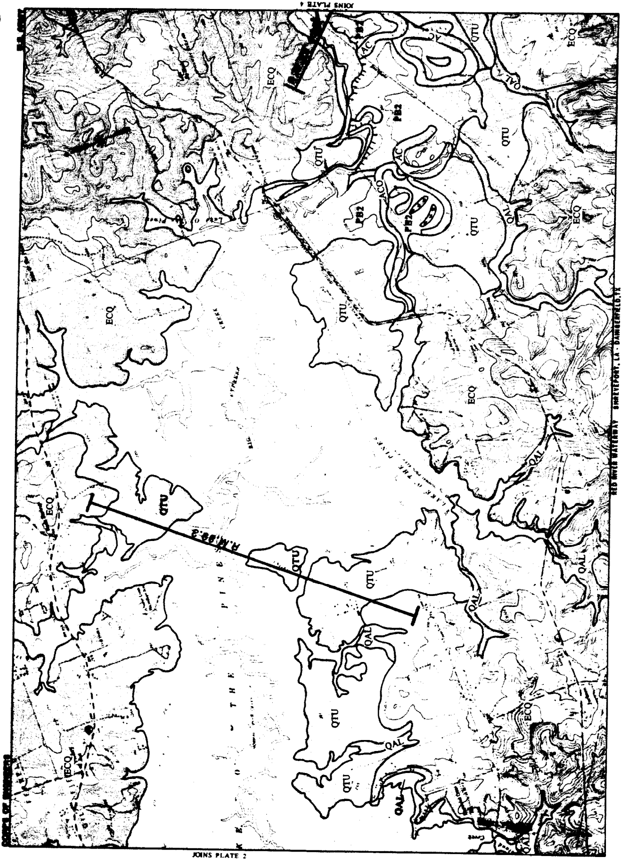
PLATE 3 OF 13